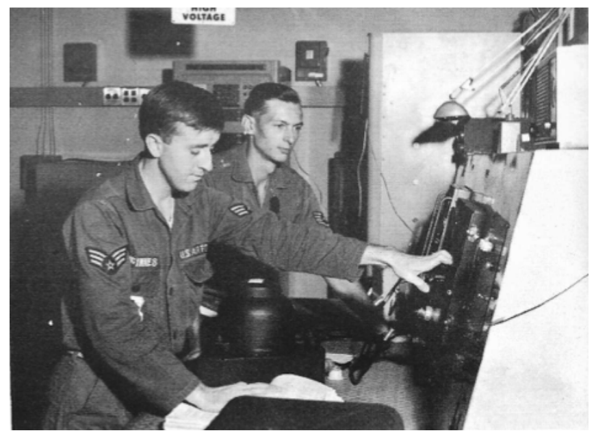
Auto pilot, Westover, @1969.