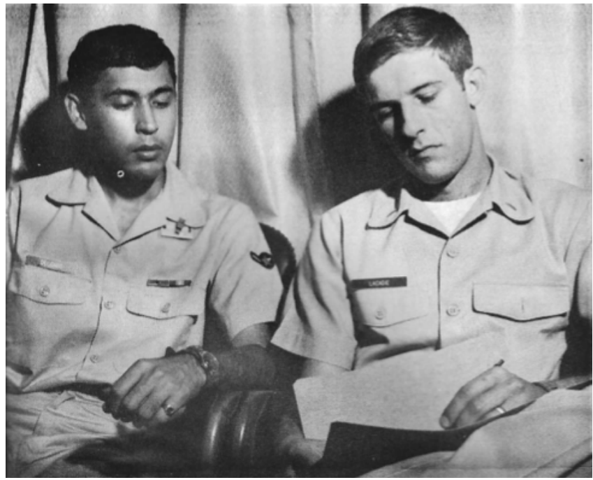
Squadron Section commander, Westover, @1969