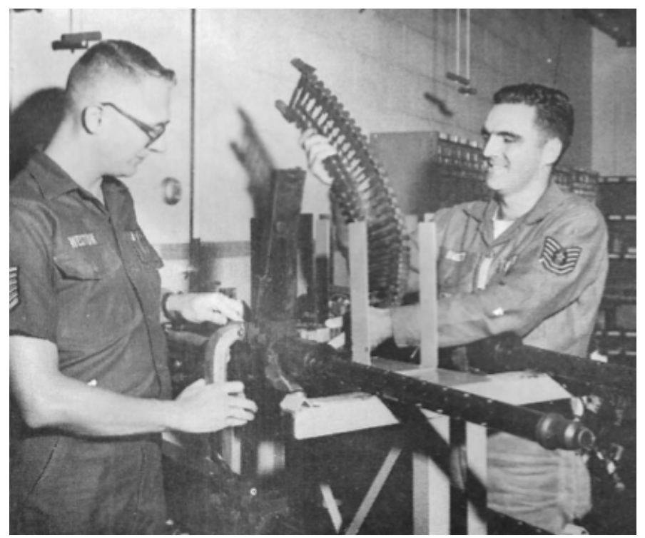
Fire control, Westover, @1969