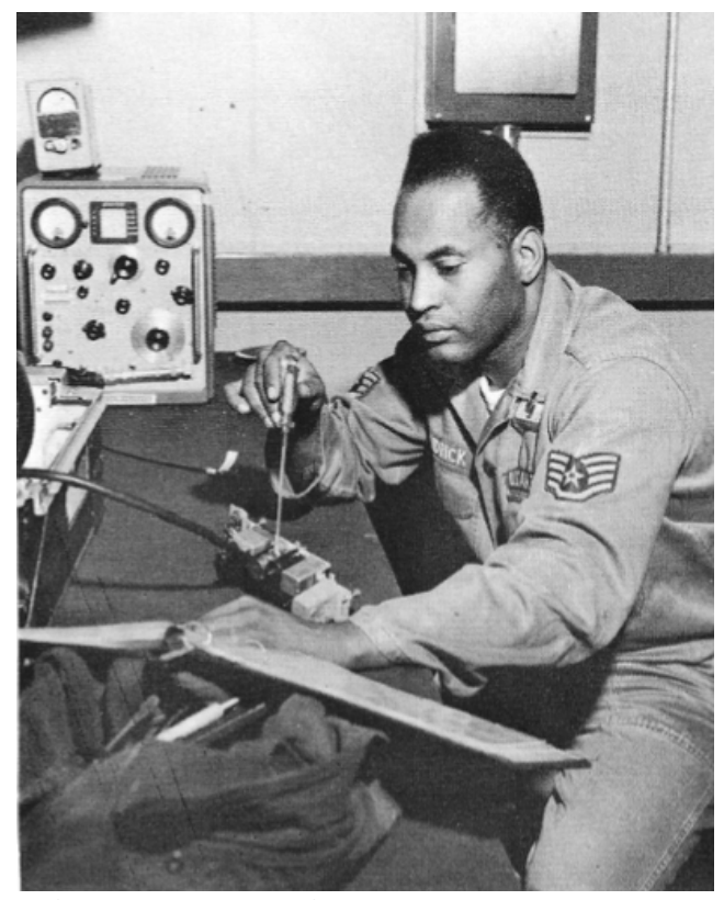
Radio Communications Shop, Westover, @1969.