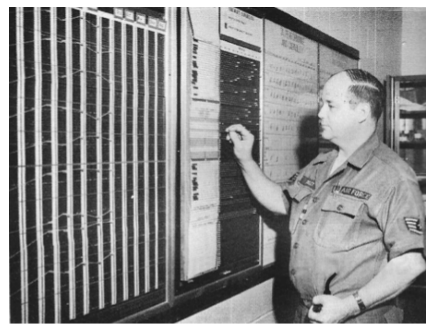
Analysis, Westover, @1969