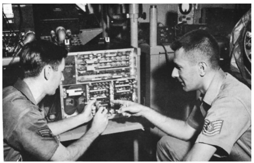
Bomb Navigation, Westover, @1969.