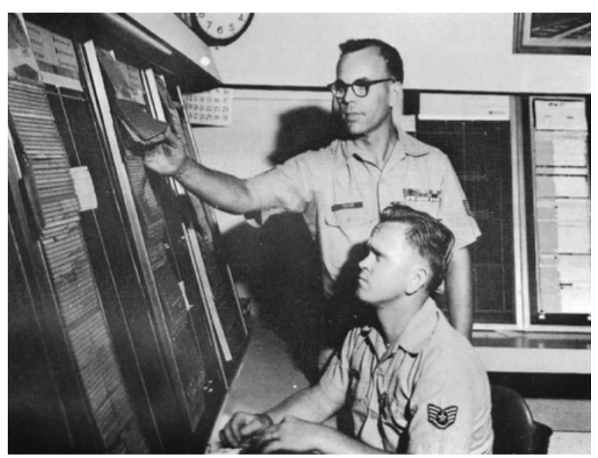
Production control, Westover, @1969.